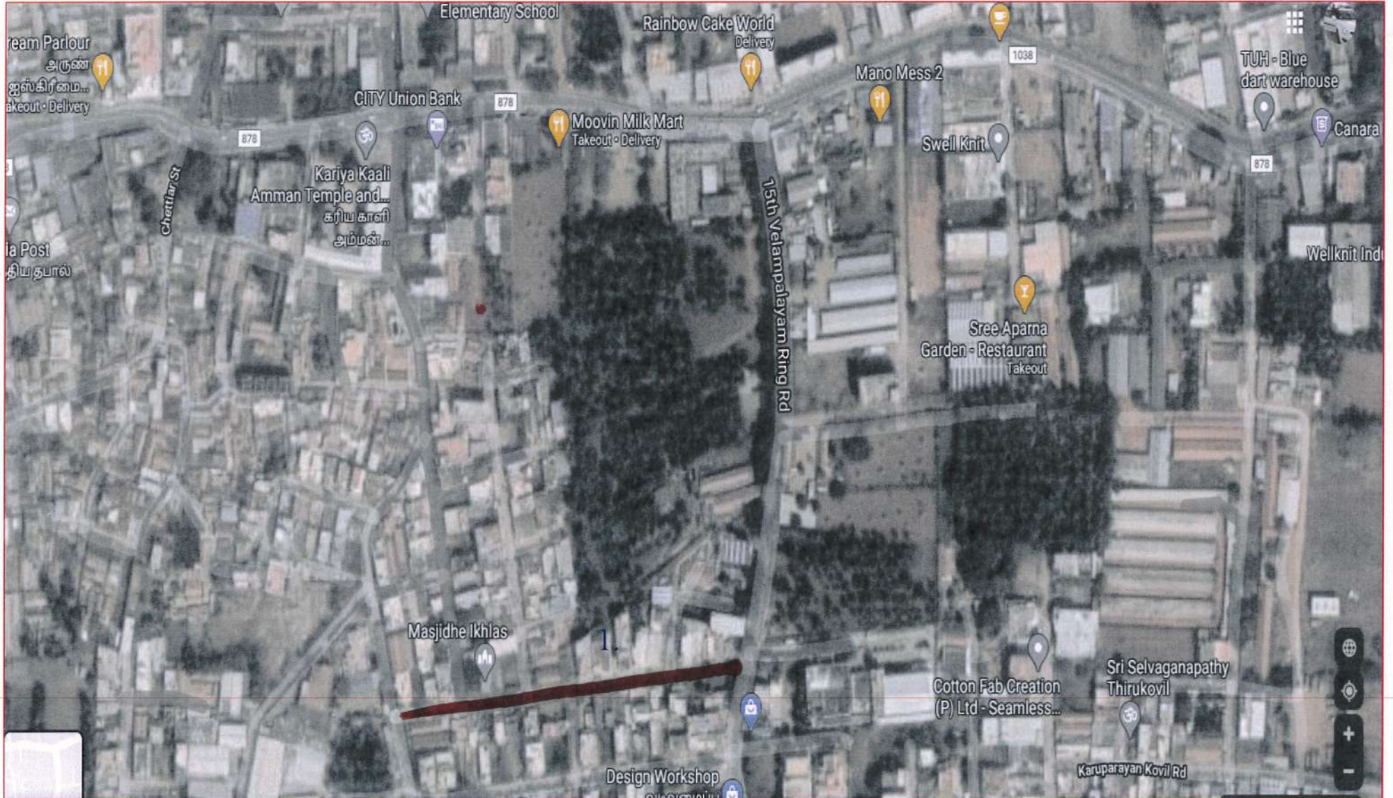
1. Vengateshwara Nagar (Ward.no : 15)